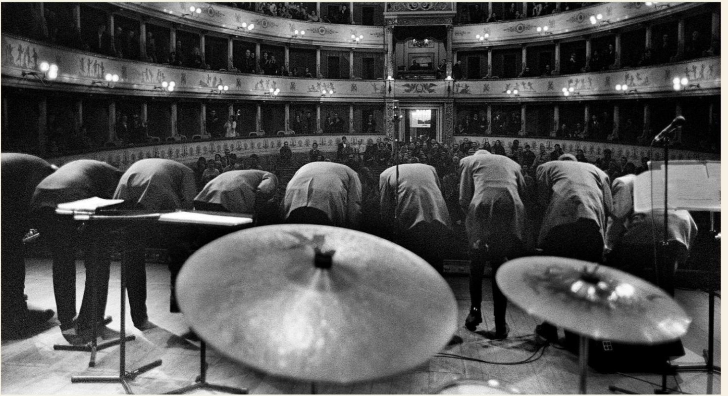
THE ROW 1997

https://www.1stdibs.com/introspective-magazine/black-photographer-photo-essay/