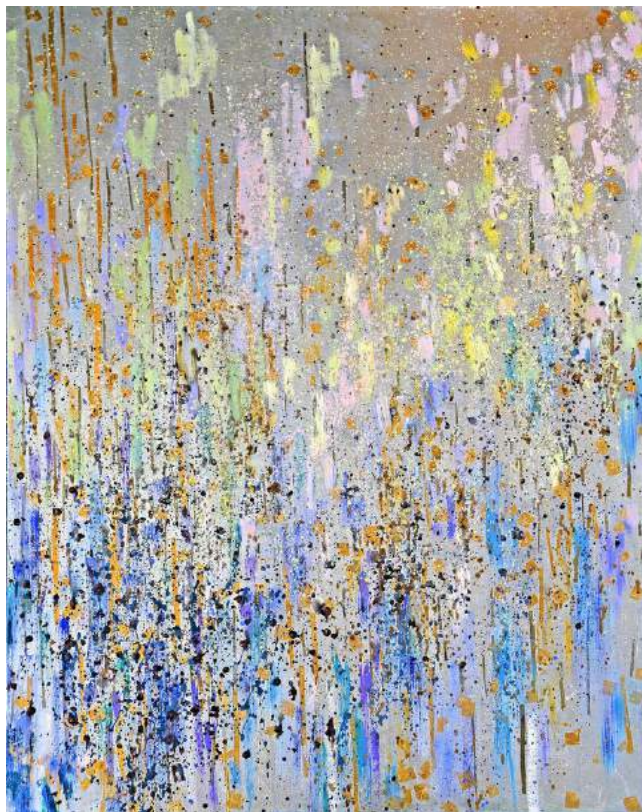
The Moon XVIII , 2018, Oil and metal leaf on canvas, 40 x 30 in.