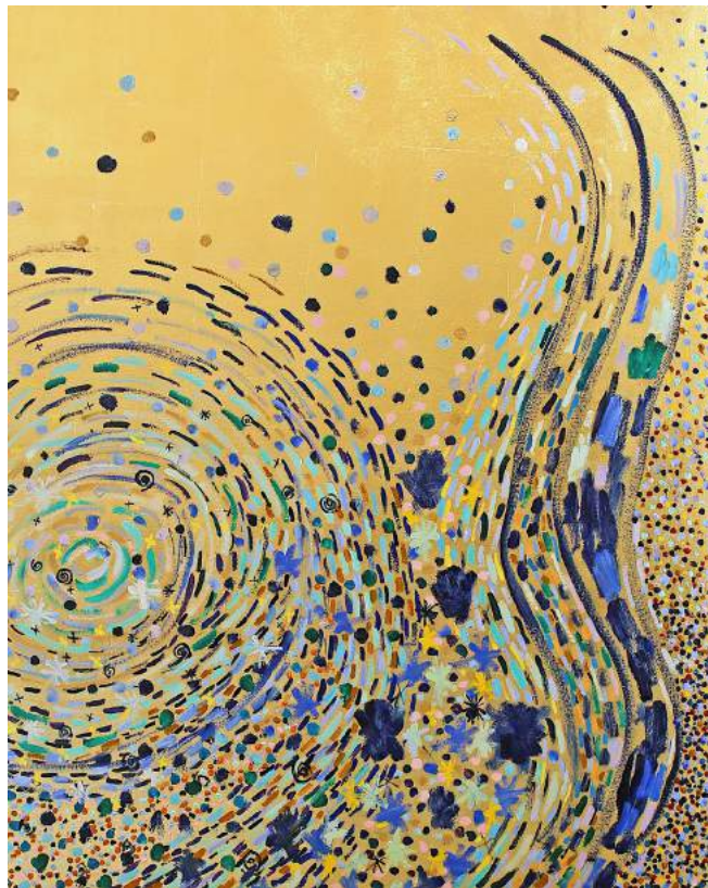
The Magician I , 2019, Oil and metal leaf on canvas, 50 x 40 in.