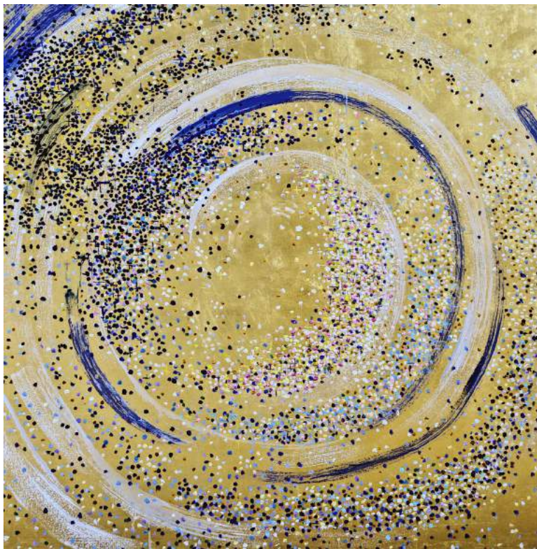
Wheel of Fortune X , 2018, Oil and metal leaf on canvas, 48 x 48 in.