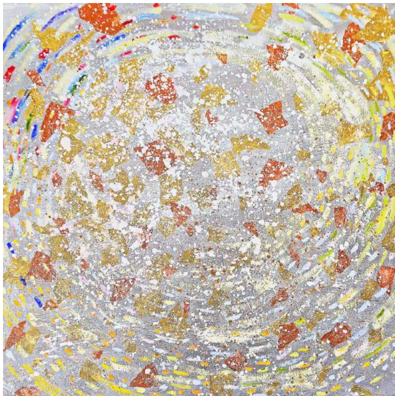
The Sun XIX , 2019, Oil and metal leaf on canvas, 40 x 40 in.