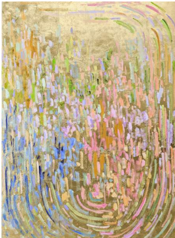
The Lovers VI , 2018, Oil and metal leaf on canvas, 48 x 36 in.