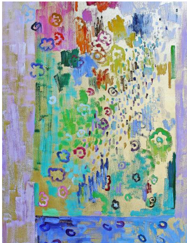
The Empress III , 2019, Oil and metal leaf on canvas, 60 x 40 in.