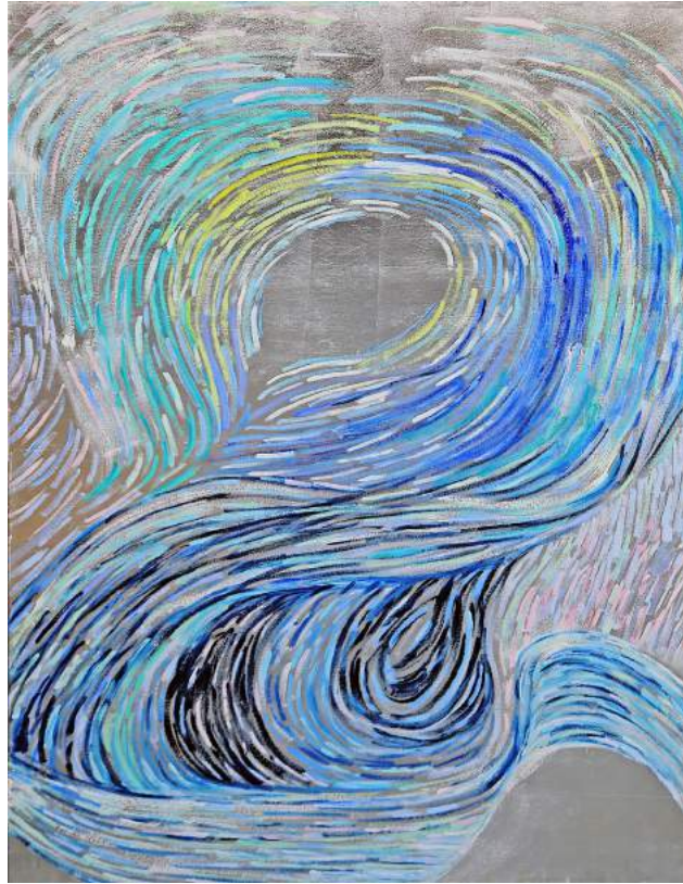
XIII , 2019, Oil and metal leaf on canvas, 60 x 40 in.