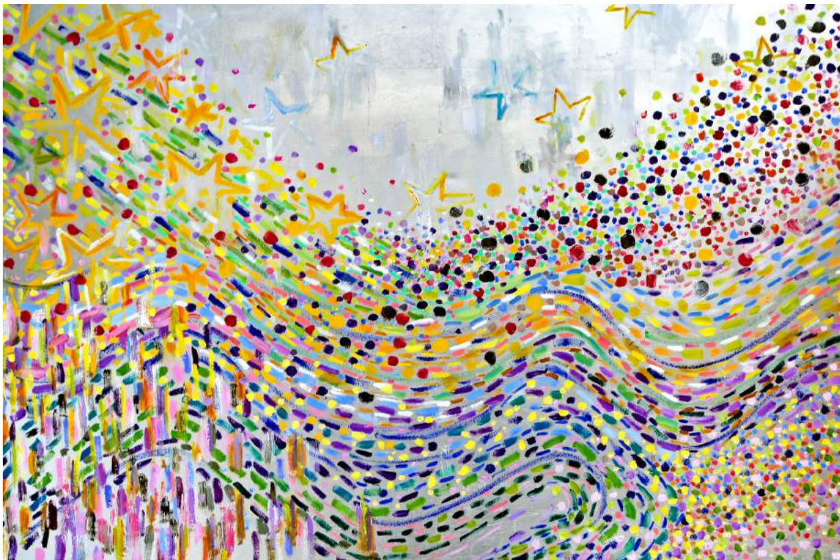
The Fool , 2018, Oil and metal leaf on canvas, 48 x 72 in.