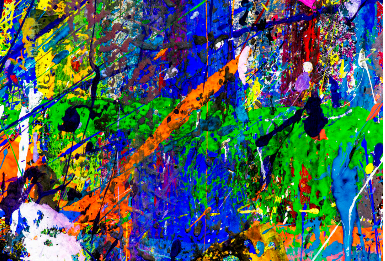
From Steven Hirsch's series, "Made in Portland."

This August, Hirsch's aesthetic curiosity took him to Portland, where he'd learned of an art school for kids, the Portland Child Art Studio, which he suspected would provide ample material for new photographs. Hirsch's interest in the studio was a giant wall, about 30 feet long and 10 feet high, upon which kids affixed pieces of paper they used in class. Painting outside the lines had, over the years, resulted in a spectacular display of shapes and colors and textures. For four consecutive afternoons, after the kids left for the day, Hirsch spent hours in front of that wall, photographing the forms within the clutter—comprising as much as five feet of wall space or as little as a few inches—that drew his eye. The photographs from that trip, " Made in Portland " are included in Hirsch's broader series, " Splat. "